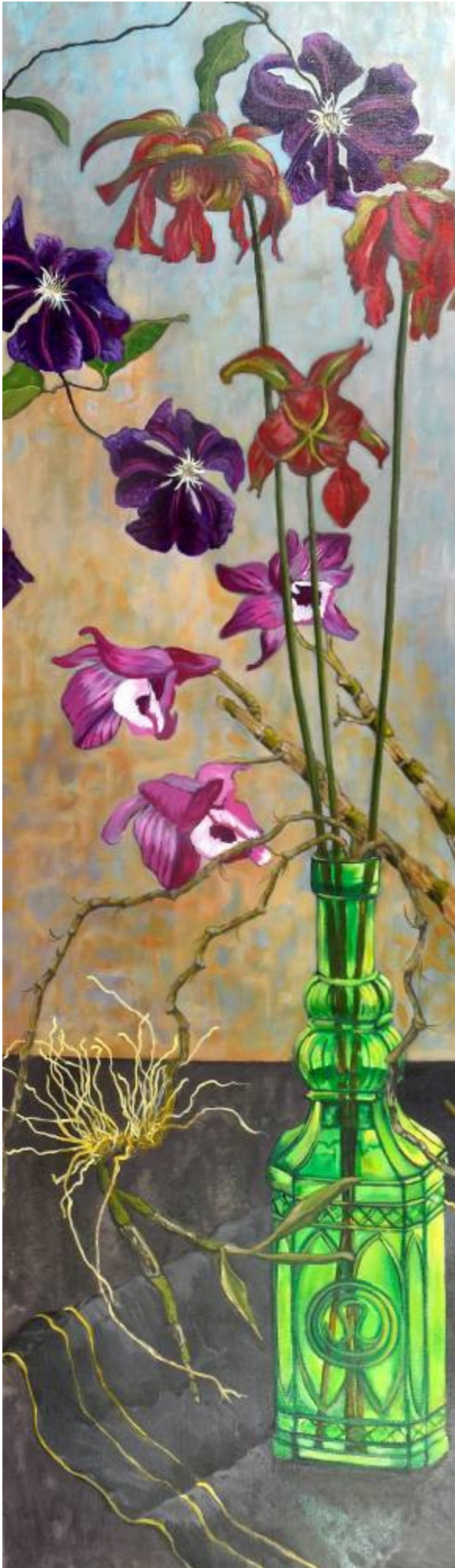
15. Bend Sinister acrylic on canvas 30 x 101cm