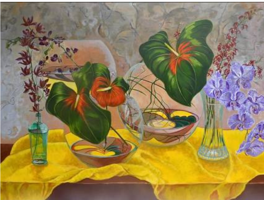
13. Wide Sargasso Sea acrylic on canvas 92 x 122cm