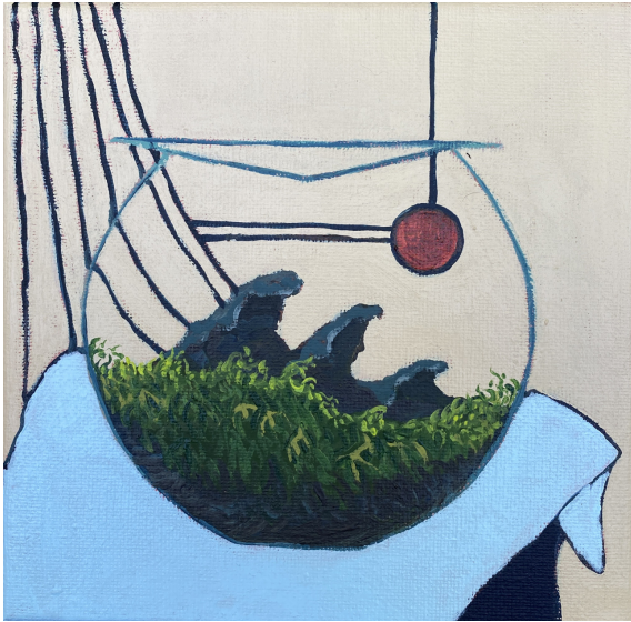
30. Orange Star acrylic on canvas 25 x 25cm