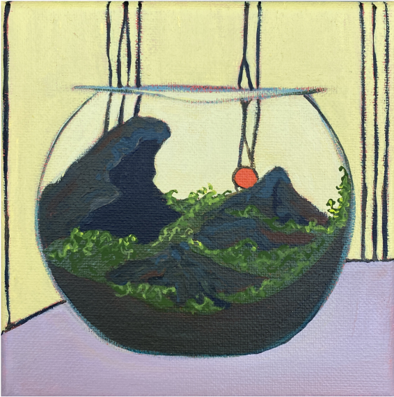
27. Flood acrylic on canvas 25 x 25cm