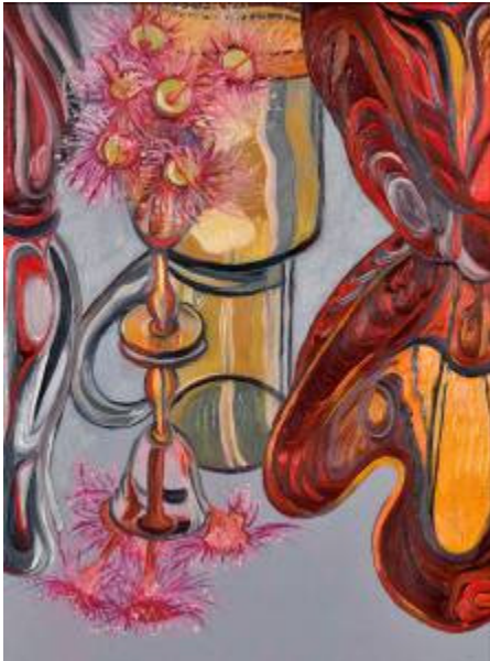
24. Contemplation oil on board 23 x 30cm