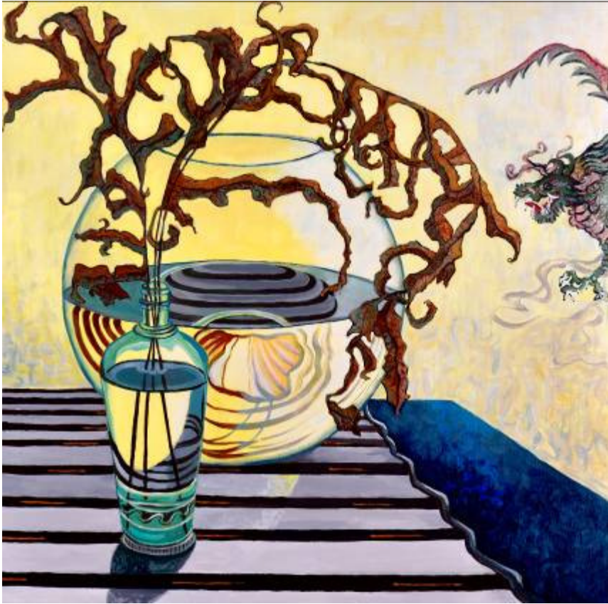
20. The Lonely Mountain acrylic on canvas 51 x 51cm