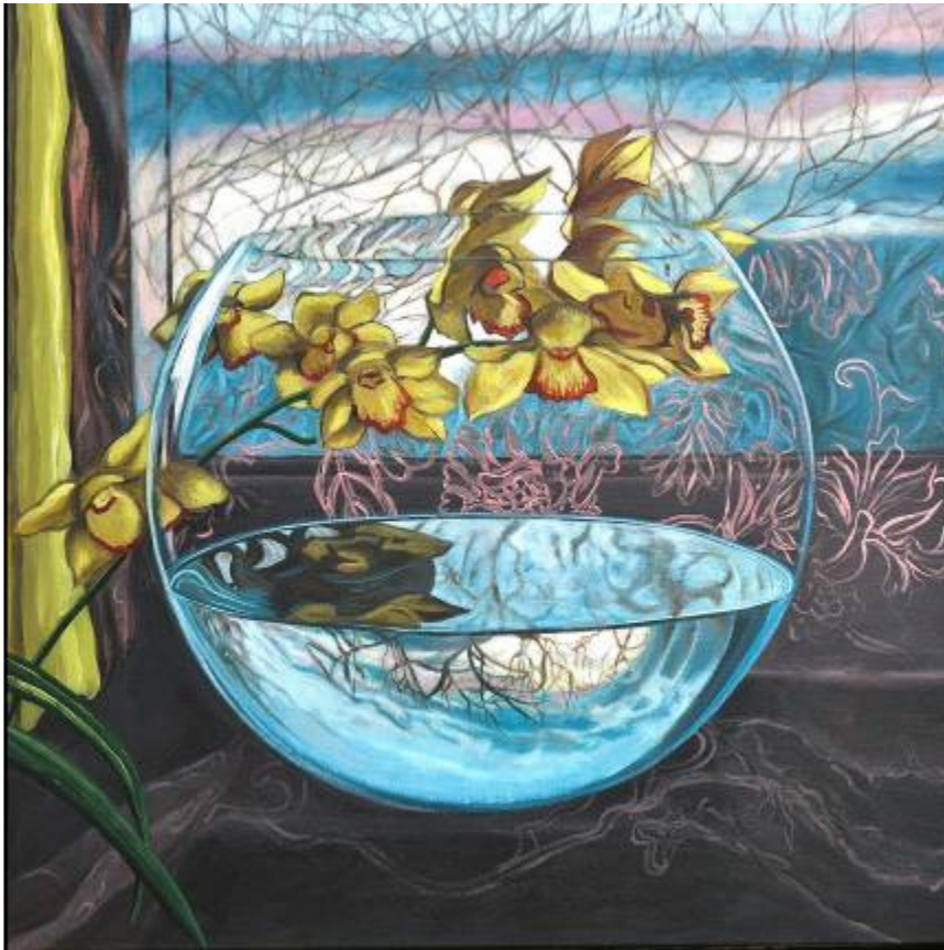
2. Melancholia acrylic on canvas 61 x 61cm