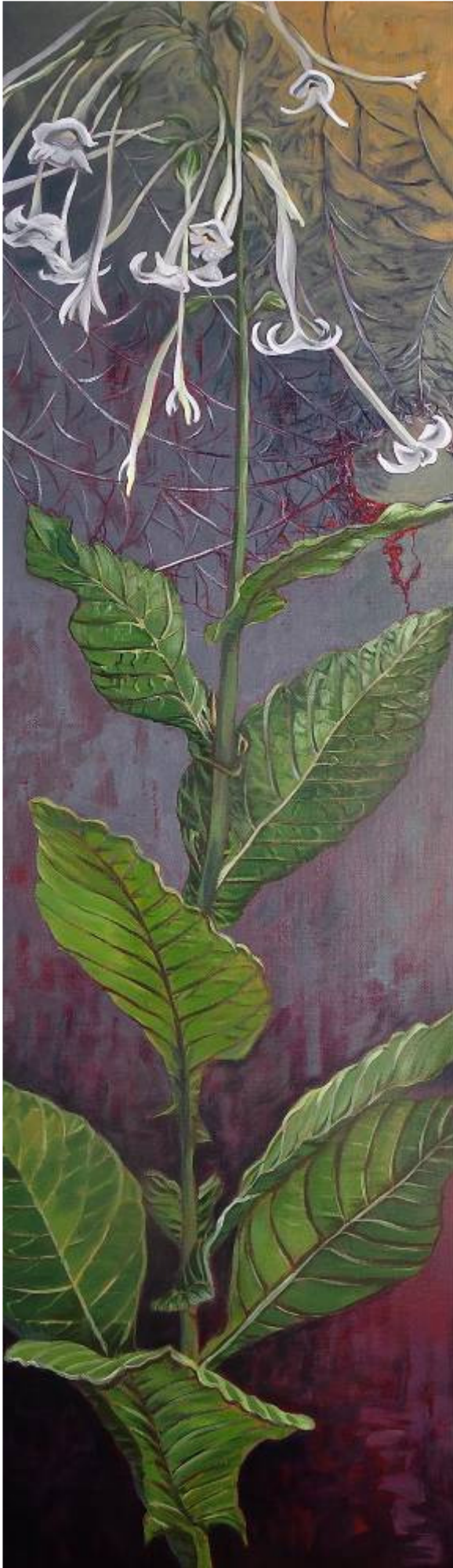
18. Nicotiana acrylic on canvas 30 x 101cm