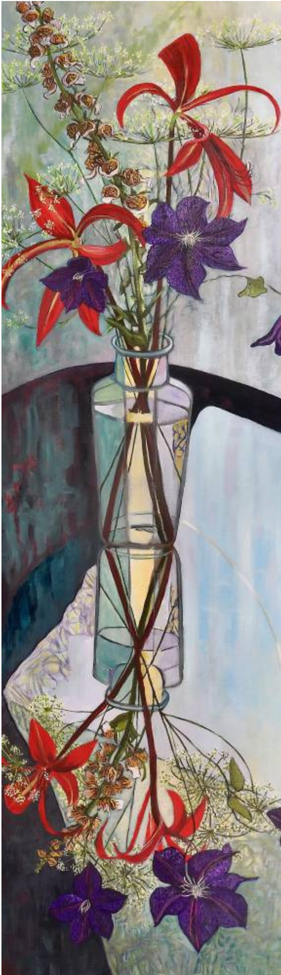
16. Ghost & Goblin acrylic on canvas 30 x 101cm