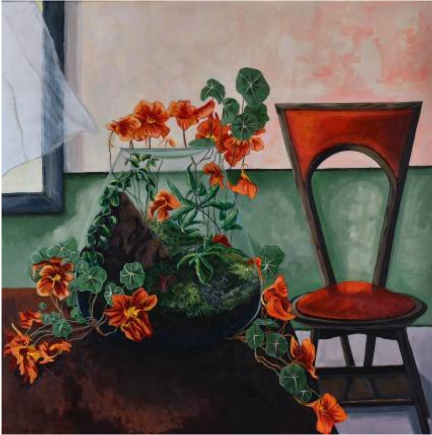
10. Entangled Life acrylic on canvas 61 x 61cm