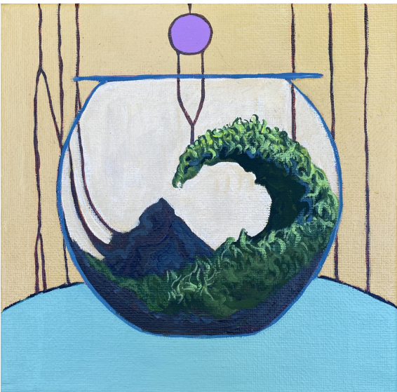
28. Lilac Star acrylic on canvas 25 x 25cm