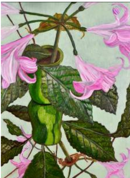
25. Interconnection oil on board 23 x 30cm