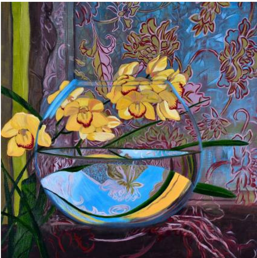
3. Pride & Prejudice acrylic on canvas 61 x 61cm