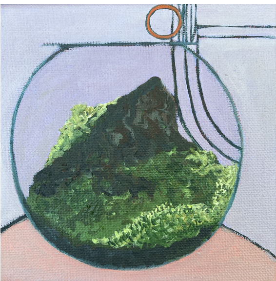
29. Mountain acrylic on canvas 25 x 25cm