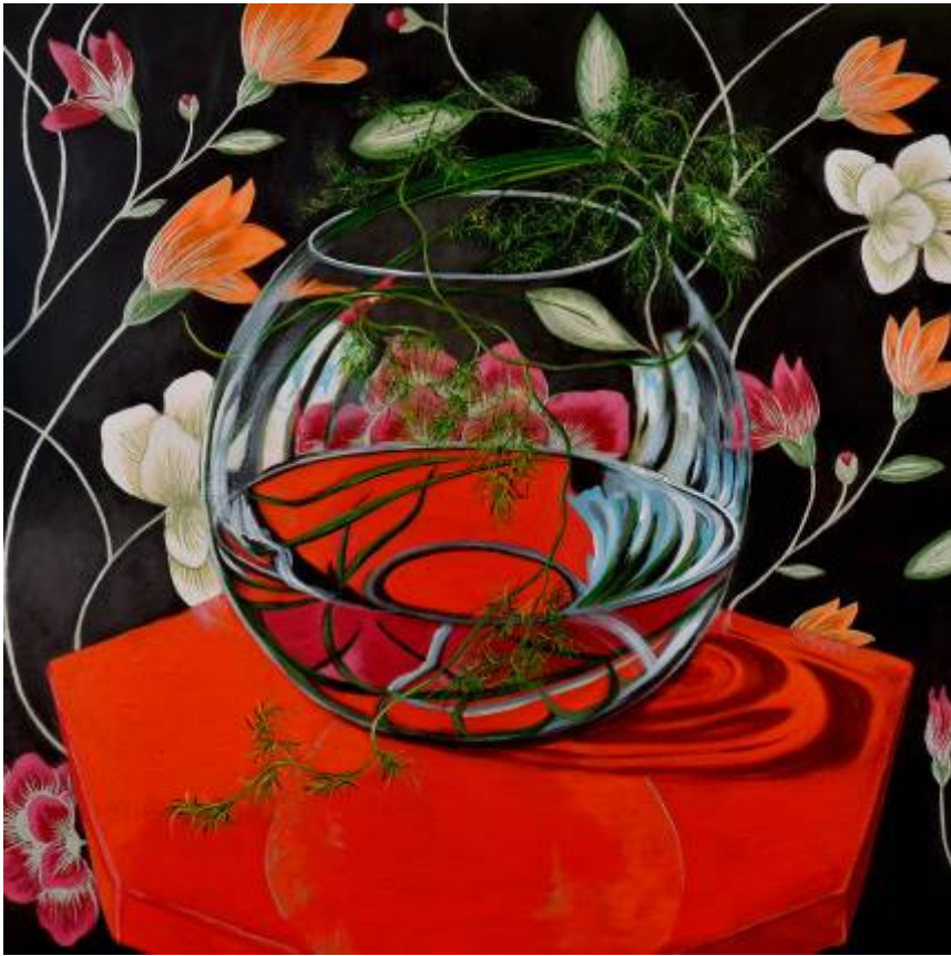
4. Fahrenheit 451 acrylic on canvas 61 x 61cm