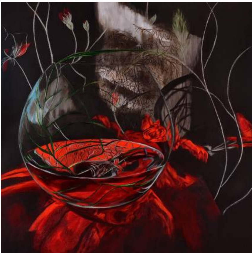
5. Fang & Claw acrylic on canvas 61 x 61cm