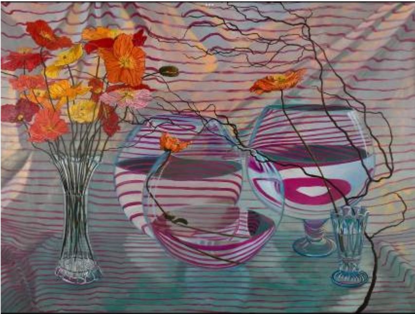
12. Geoffrey's Poppies acrylic on canvas 92 x 122cm