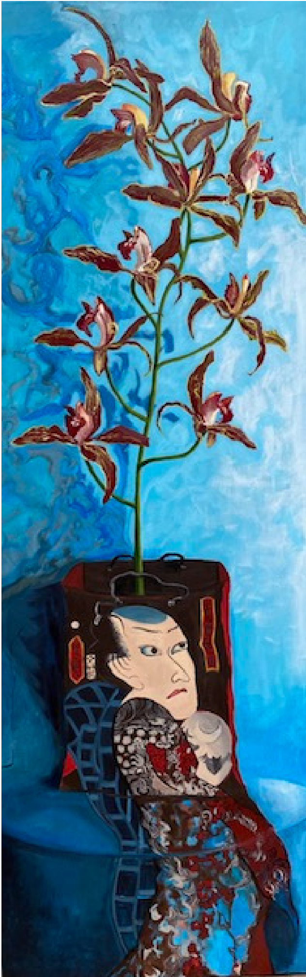
19. An Unquiet Mind acrylic on canvas 38 x 114cm