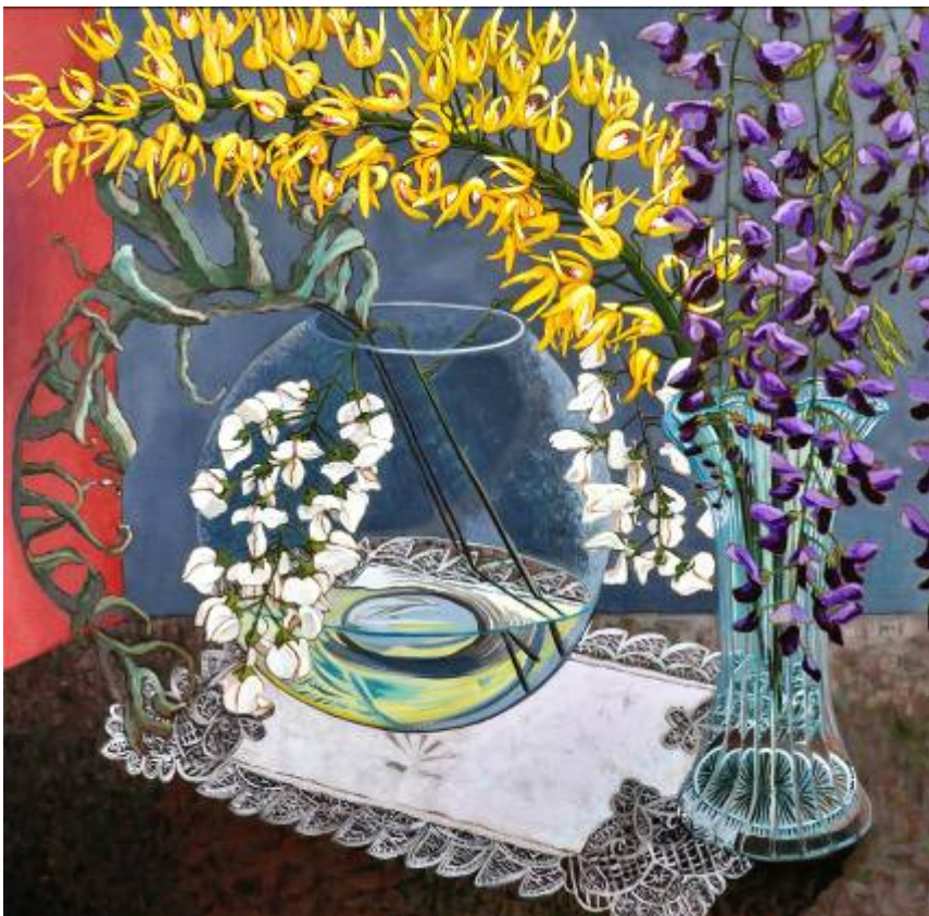
7. The Great Gatsby acrylic on canvas 61 x 61cm