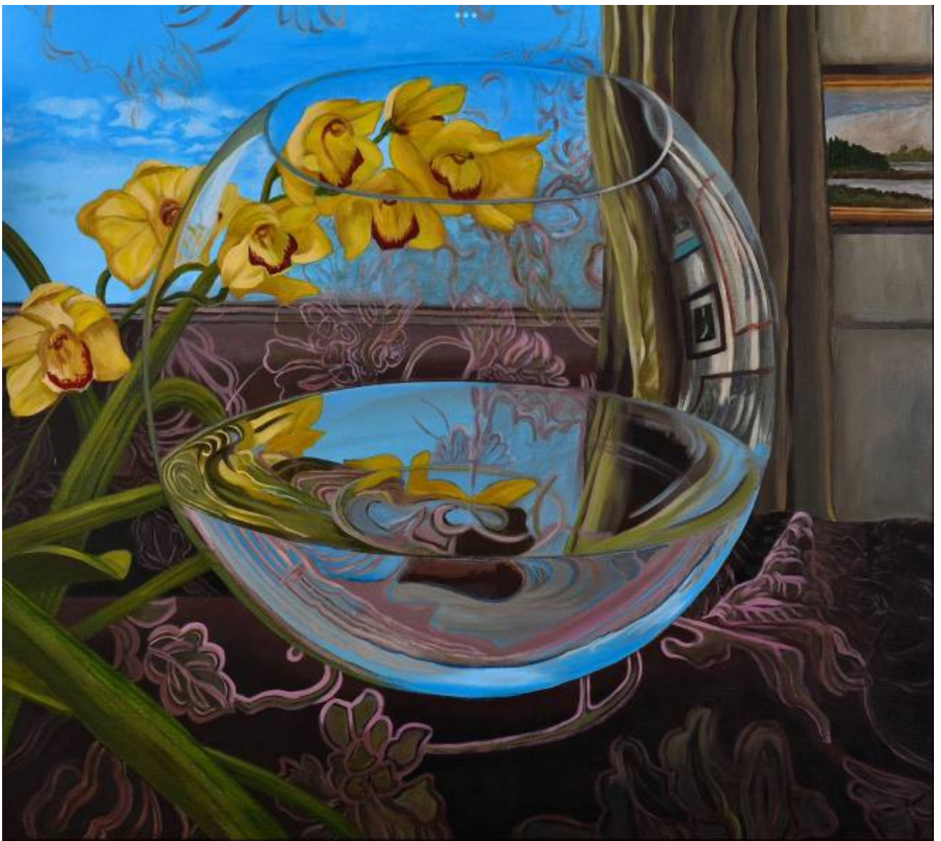
1. A Room of One's Own acrylic on canvas 61 x 61cm