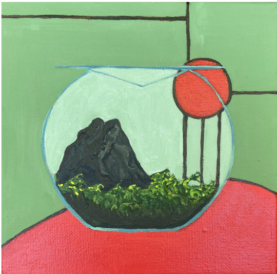
31. Red Star acrylic on canvas 25 x 25cm