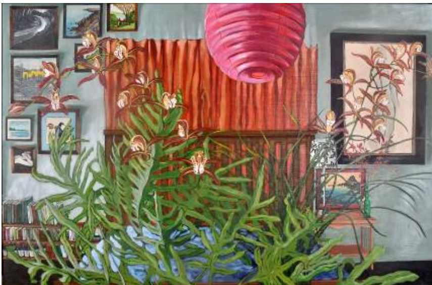
23. The Year of Magical Thinking acrylic on paper 60 x 90cm