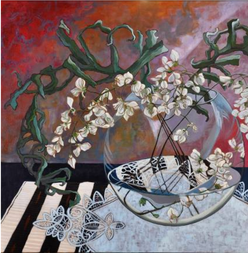
8. Fret acrylic on canvas 61 x 61cm