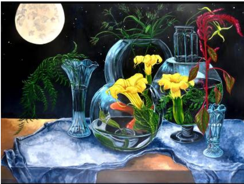
11. One Hundred Years of Solitude acrylic on canvas 92 x 122cm