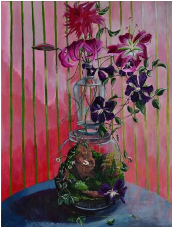
22. Underworld acrylic on canvas 45 x 60cm