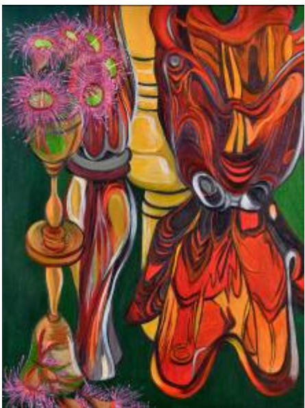
26. Kaleidoscopic acrylic on board 23 x 30cm