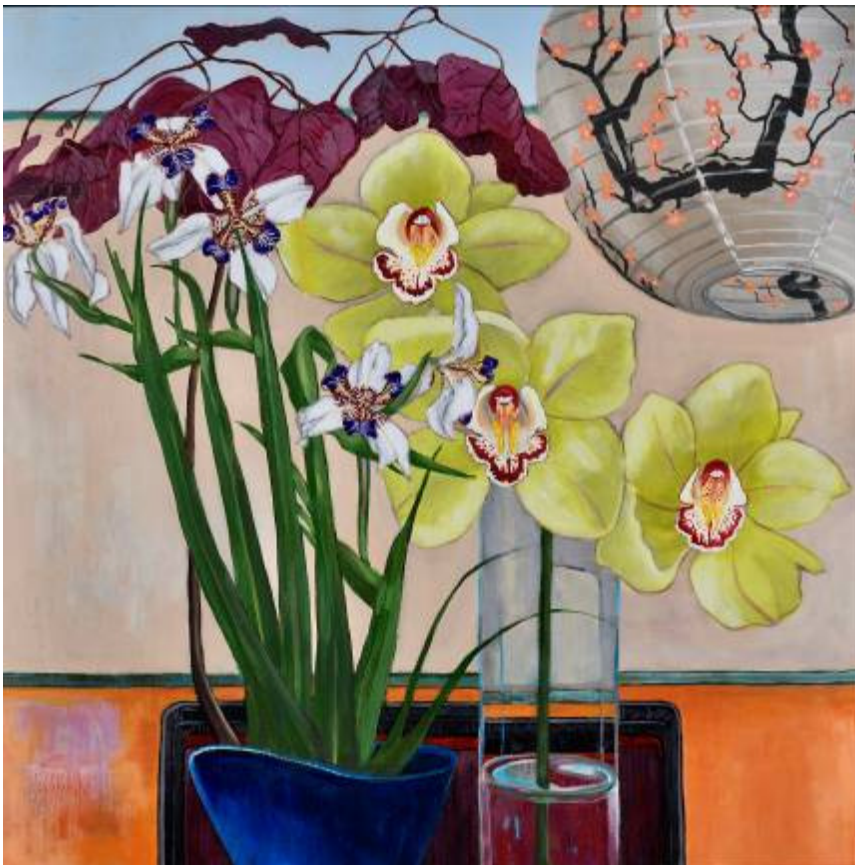
21. An Artist of the Floating World acrylic on canvas 51 x 51cm