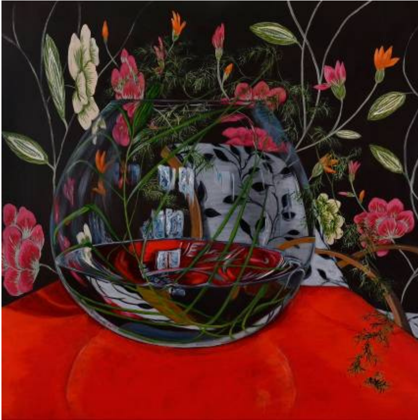
6. Wuthering Heights acrylic on canvas 61 x 61cm